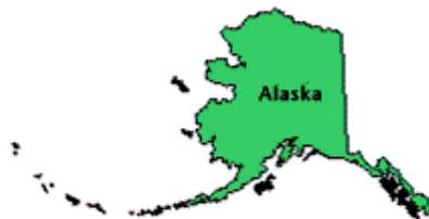
The Zones of United States Masters Swimming